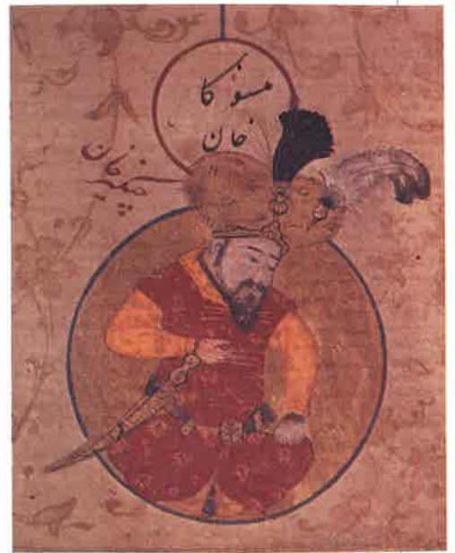
▲ The great Mongol ruler Genghis Khan is pictured in this portrait from a Turkish manuscript. Most representations of Mongol rulers come from other cultures.

Although Genghis Khan knew the strength of his warriors, he realized that there were areas where the Mongols were weak. The Mongols lacked a written language. So Genghis used a captured scribe to create a written language for them. He also used the skills of foreign craftsmen and specialists