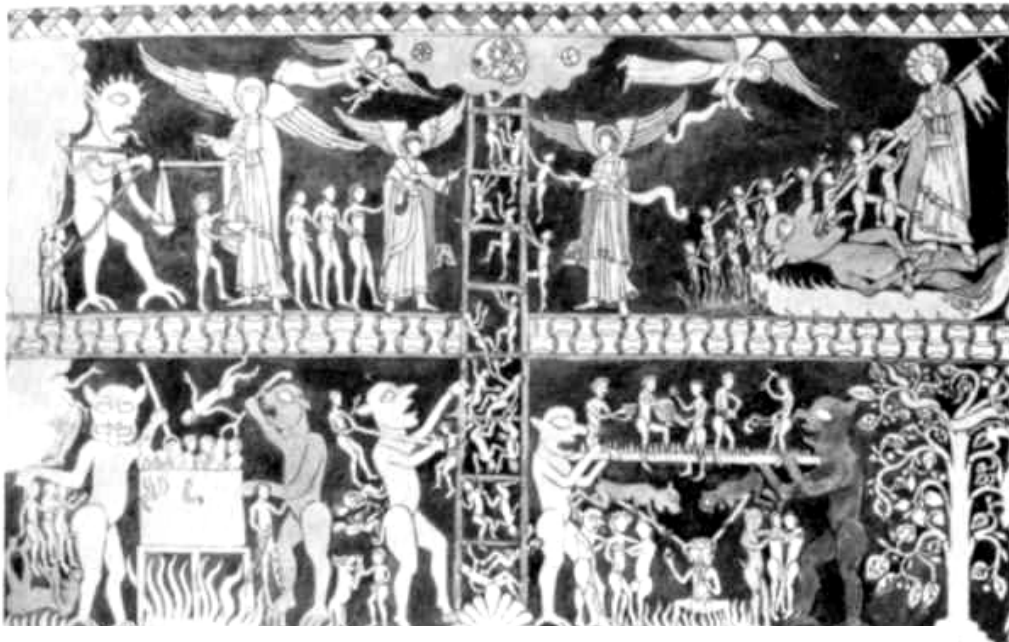
Source 2 - A Doom Painting

Village and parish priests were simple men, but they had very important jobs. After the Lord of the Manor, the priest was the most important man in the village. On Sundays, during mass, he would tell people all about Heaven and Hell. Because services were in Latin , many ordinary folk could not understand them. Statues and ' Doom Paintings ' were used to explain to people the horrors of Hell and the joys of Heaven. Look at the doom painting below. What things can you see going on?